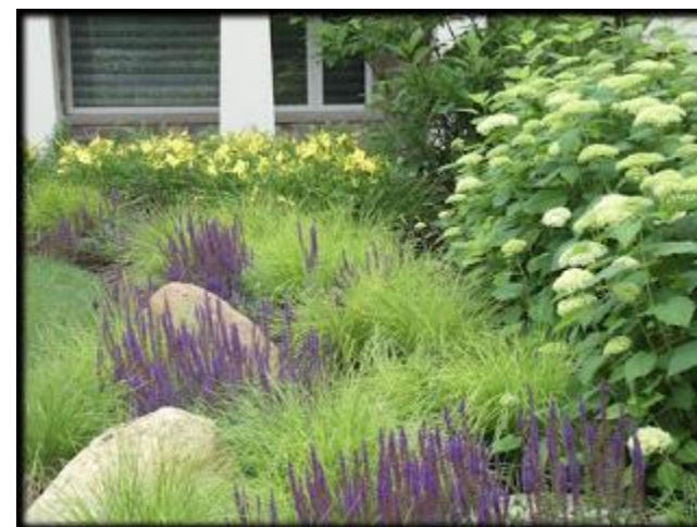
From Greener Gardens – Photo by Jeff Epping.

Location: Premier Bank Community Room (basement), 1400 Black Bridge Road (Behind the Milton Ave. McDonalds)