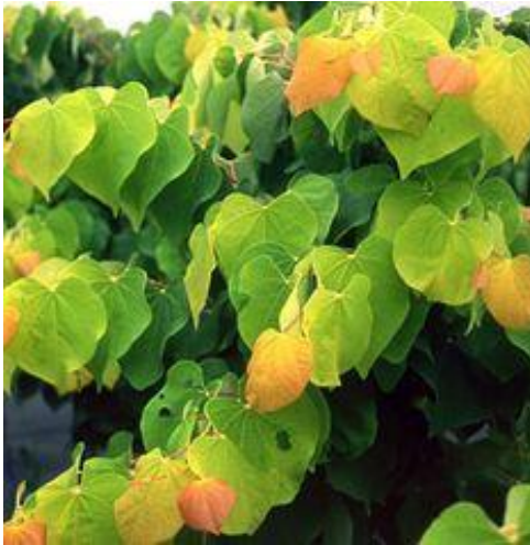
Fall color on redbud