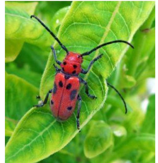
A Red Milkweed Beetle

August 11 , Create a Tropical Effect in Your Garden Walk, 6-7:30 p.m., $12/$15. Registration Deadline: August 1.